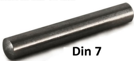
Din 7 Rounded Ends

Catalogue includes dowel pins of type Din 6325 (ISO 2338) and Din 7 in various materials.