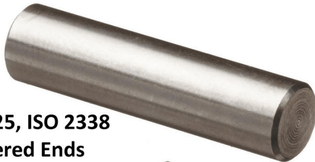
Din 6325, ISO 2338 Chamfered Ends