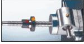
Upright Rotating Screw (Standard)